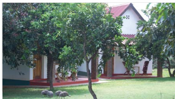
Green Tree Lodge

With all these things and more, our holiday in Livingstone, was just amazing. We couldn't have asked more from the staff of Green Tree Lodge and are already planning our trip for next year. Zambia has it all, go with a sense of adventure and be prepared to be amazed and excited by this simply unique country.